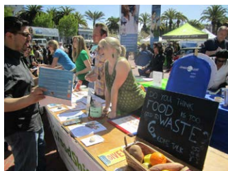
Volunteer with Food Shift at the BART Blue Sky Festival