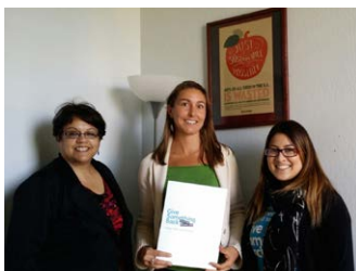
Food Shift receives grant from Give